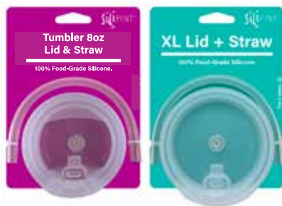
PICTURED ABOVE: Lid + Straw Packs *available in Frosted White and Bouncy Black